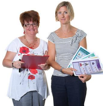
Create an information kit