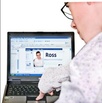
Set up Facebook