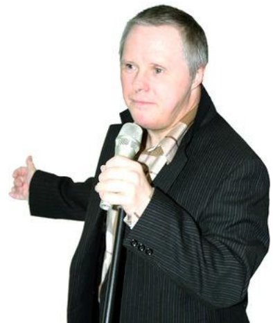
Speak at conferences