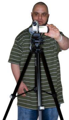
Make a DVD