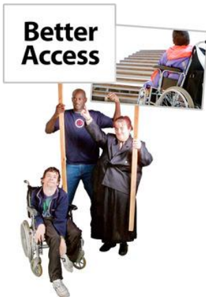
Hold a rally