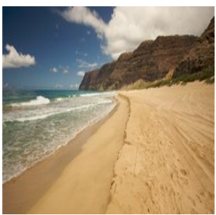
By the Sea